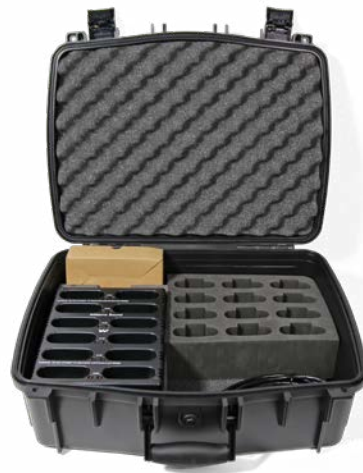
CHG 3512 PRO