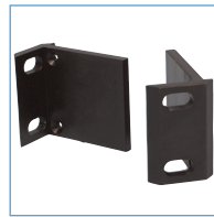
PLRM 19" rack mounting bracket allowing easy installation into standard 19" cabinets