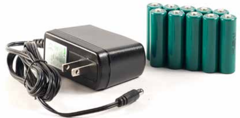
RC-30 Rechargeable Battery Kit

CAUTION: NEVER recharge other types of batteries. Doing so can result in battery explosion. Use only rechargeable Nickel-Metal Hydride (NiMH) batteries.